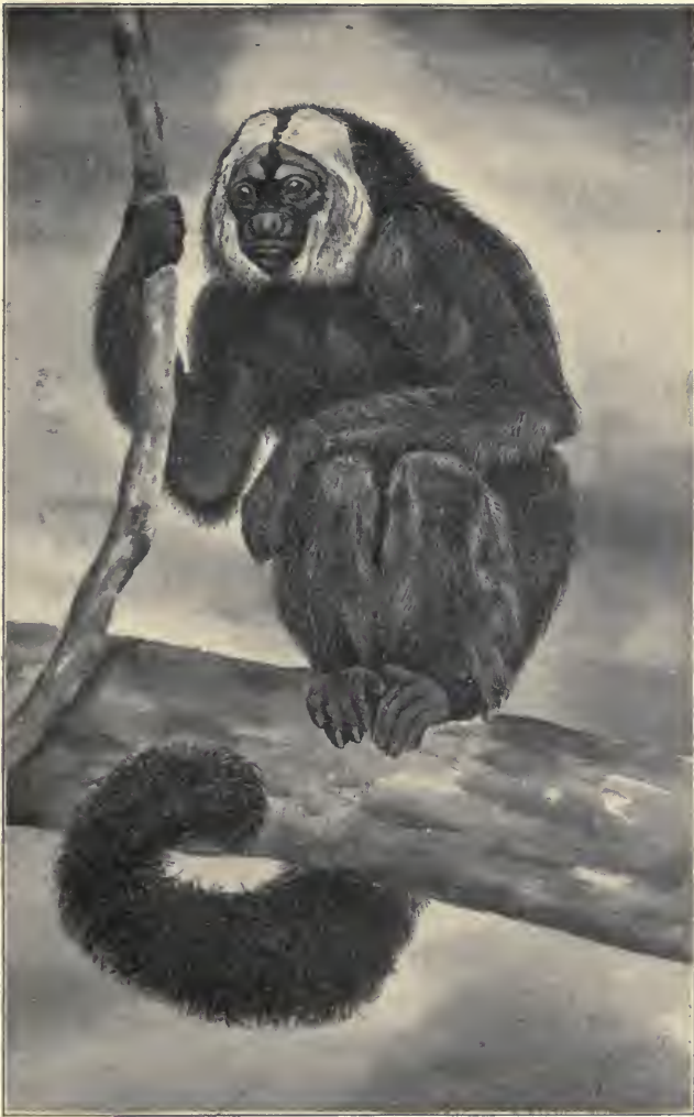
FIG. LXXXII. PITHECIA PITHECIA. BLACK YARKEE.

Callithrix E. Geoff., Ann. Mus. Hist. Nat. Paris, XIX, 1812, p. 112. (nec Erxleben, 1777.)